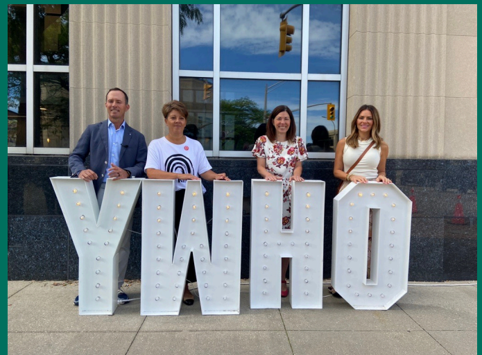
The Annual Golf Fore Health Tournament was another huge success, a sold out event that raised over $34,000 for your local hospital!