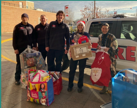
The most wonderful time of the year! A special Christmas delivery from Point Edward Fire & Rescue, who donated over 200 gifts following the Santa's Responders Toy Drive